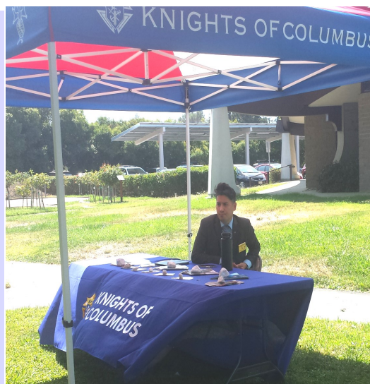
Knights at Ascension Picnic, Sept 10, 2017

Despite its age, it was still sound upon inspection Though not quite dead, it clearly needed resurrection I began each day reaching for tools and glove As weeks became months, it was a labor of love So as progress in made and completion nears Here's hoping the sign lasts another fifty years