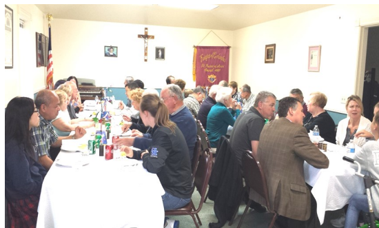
Scholarship Night Dinner